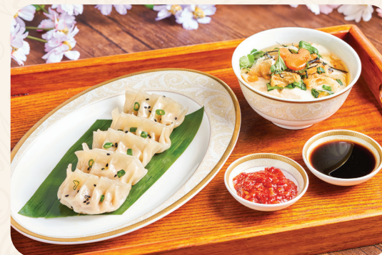
咸豆花配猪肉煎饺 Chinese Tofu Pudding with Fried Pork Dumpling