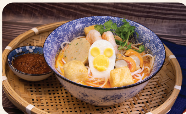
海鲜叻沙面 Seafood Laksa