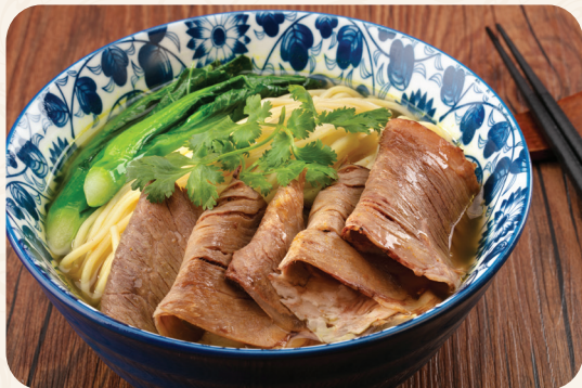
咖喱牛肉面 Curry Beef Noodle

适用于7:00-11:00 Available during 7:00-11:00