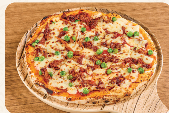
手撕猪肉披萨 Pulled Pork Pizza