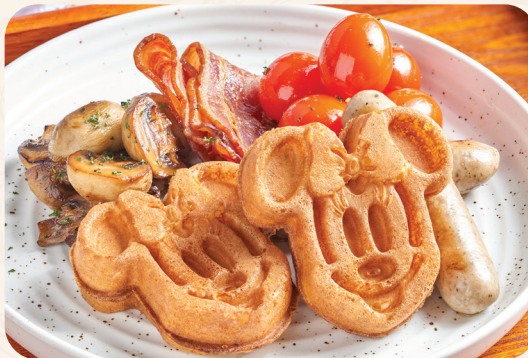
早餐华夫套餐 配培根, 香肠, 炒蘑菇, 炒番茄