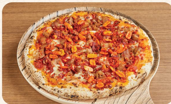
辣味鸡肉披萨 Spicy Chicken Pizza

Add RMB 38 to upgrade the bottled drink in combo to Fresh Orange Juice/Apple Juice/Pineapple Juice