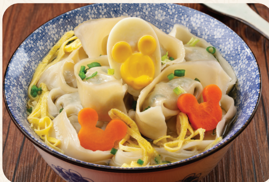
上海菜肉馄饨 Shanghai Style Pork and Vegetable Wonton