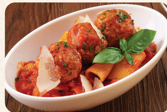
肉丸意面 Rigatoni with Meat Ball Ragout