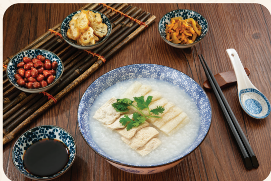
竹荪鸡片粥 Chicken and Bamboo Pith Congee