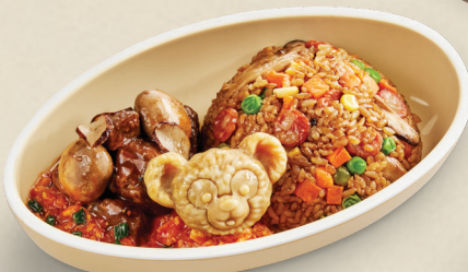
黑松露牛肉滑蛋配香肠饭 Black Truffle Beef with Egg and Sausage Rice 420克/g