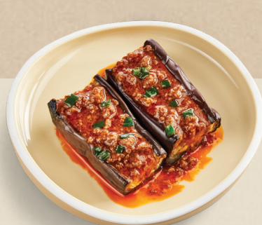
鱼香烤茄子 Roasted Eggplant with Yu Xiang Sauce 140克/g