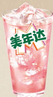
美年达粉红树莓味 Mirinda Pink Raspberry