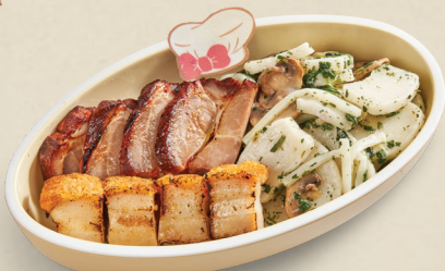
叉烧脆皮猪肉配年糕 BBQ Roasted Pork with Crispy Pork and Rice Cakes 360克/g