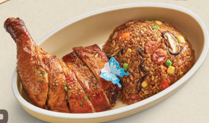
烤鸡腿配香肠饭 Roasted Chicken Leg with Sausage Rice 420克/g