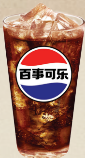
无糖百事可乐 Pepsi No Sugar