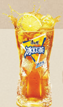
康师傅冰红茶 KSF Iced Tea