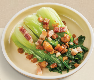
猪油炒青菜 Wok-fried Boy Choy with Pork Lard 150克/g