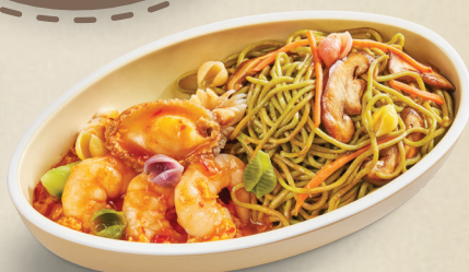
烩香辣海鲜配蔬菜炒面 Braised Seafood with Spicy Chili Sauce and Vegetable Noodles 340克/g