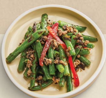
和牛肉末炒四季豆 Wok-fried Green Beans with Wagyu Beef Minced Meat 150克/g