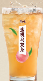
康师傅蜜桃乌龙 KSF Peach Oolong Tea